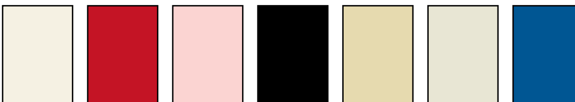
Primer Red Pink Flat Black Ivory Light Almond Blue

To order custom metal wall plates, see Pages P-40 – P-42. For additional colors consult factory.