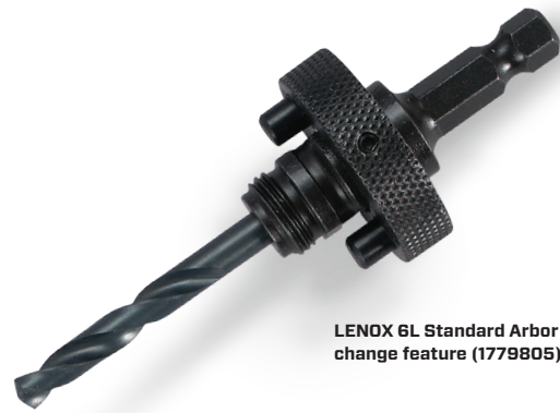
LENOX 6L Standard Arbor with quick change feature (1779805)

Split point pilot drill for faster penetration and less walking