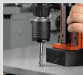
Tapping with fast change tapping chuck