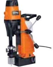
JHM USA 5 Core drilling unit with two-speed gear box for workshop jobs, cutting depth up to 3" (75mm)