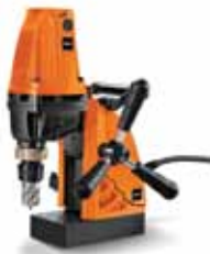
JHM Short Sluggger Very compact core drilling unit for drilling on-site