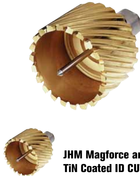
JHM Magforce and Sluggers TiN Coated ID CUTTERS

Sluggers solution for difficult drilling applications