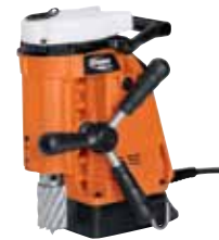
JHM Magforce Compact core drilling unit for drilling operations in tight spaces