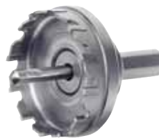
Carbide-tipped sheet metal cutters are not available in TINI, TC or cobalt.