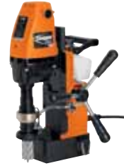
JHM USA 101 Durable, dependable workhorse for on-site drilling