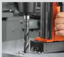
Twist drilling with chuck or MT 3 holder