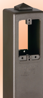
Low voltage separator