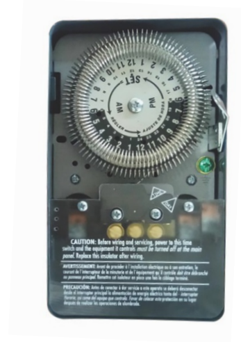
8009A 24 Hour Duty Cycle Time Switch