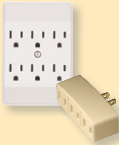
Taps & adapters F-2

Eaton's Wiring Devices offers a broad line of accessories for a wide range of needs throughout the home. Here you will find surge protection adapters, grounded and ungrounded outlet taps and adapters plus accessories used for device testing, installation, and safety. All our accessories are manufactured to rigorous quality standards from high quality materials.