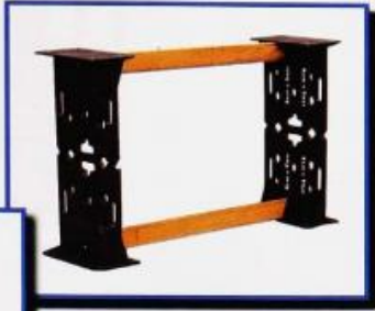
Work bench frame