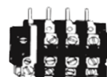
200-Line Block Overload Relay