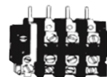
200-Line Block Overload Relay