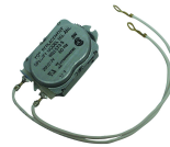
WG1573-10DMX 208-277 VAC, 60 Hz Motor for T102, T104, T106, T172, T174, WH40