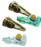
156T1978A Extra/replacement trippers 1 ON and 1 OFF