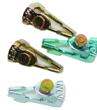
156T1978AD12 12 Pack of 156T1978A Trippers for T100, T7000, and WH40