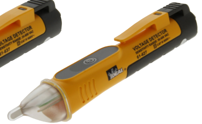
61-627 Single Range 50 to 600V AC NCVT CAT IV 600V