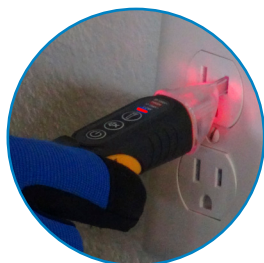
Detects AC voltage at outlets (including TR's w/61-657)