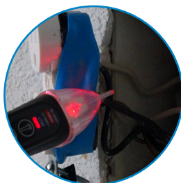
Detects AC voltage on conductors