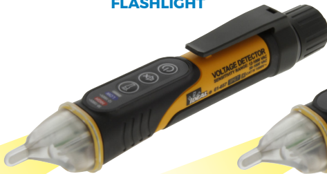
61-657 Dual Range 12 to 1000V AC NCVT w/Flashlight CAT IV 1000V