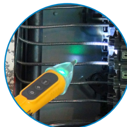
Detects AC voltage at panels