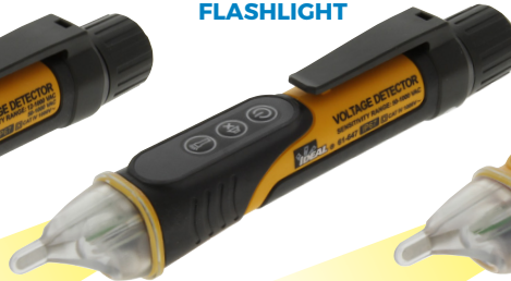
61-647 Single Range 50 to 1000V AC NCVT w/Flashlight CAT IV 1000V