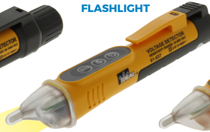
61-637 Single Range 24 to 600V AC NCVT w/Flashlight CAT IV 600V