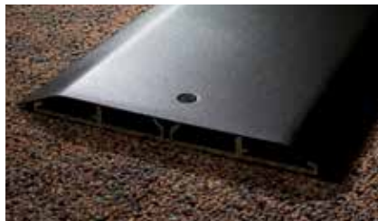
OFR Series Raceway features the lowest profile available in overfloor raceway systems.