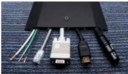
Four-channel base of OFR Series Overfloor Raceway provides channels for multiple combinations of services.