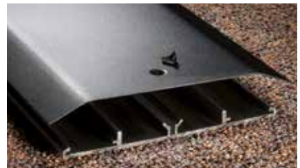
Tamper-resistant feature prevents unwanted access to raceway-provided services.