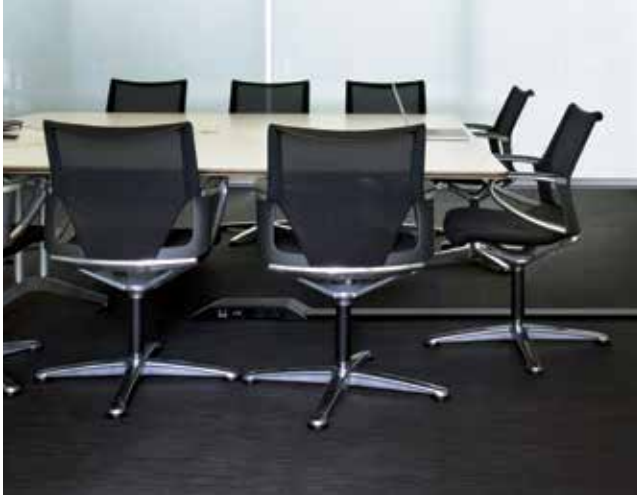
OFR Series Raceway provides access to power, A/V, and communication services to open-space areas in an ADA compliant low profile design.