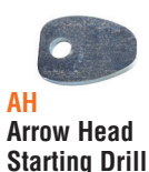
AH Arrow Head Starting Drill