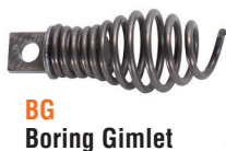
BG Boring Gimlet