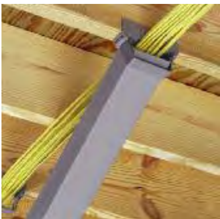
4 When the desired number of cables is run, install cable trough by tilting the trough into the first bracket, sliding it under the installed cables. Raise the trough as it is inserted further into the support bracket.