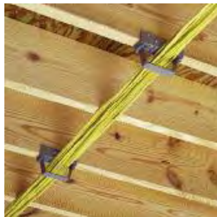
3 Run cables through the installed support brackets. Support brackets can be opened if desired.

TIP: Bracket hinge can be opened for ease of attachment to framing if desired. Simply lift lower portion up and flex catch inward slightly to open.