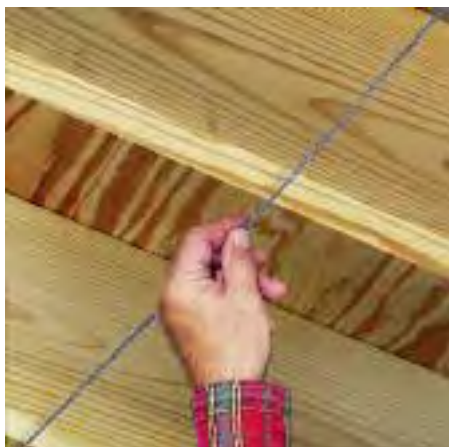
1 Strike chalk line in desired location for CableWay™.

Rated for a maximum load of 6 lbs/linear foot of runway