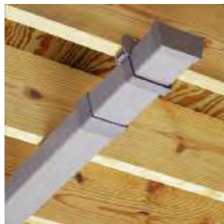
6 The last section of raceway may need to be cut to fit. Install end caps where the cable runway system terminates. End caps simply push on to the ends of the trough.