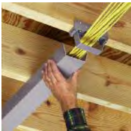
5 When the trough sits level in the bracket, slide the trough (wire tray) back into a second bracket. Install additional sections, using couplings to join the pieces in the same manner. Couplings push-on to the ends of the raceway.