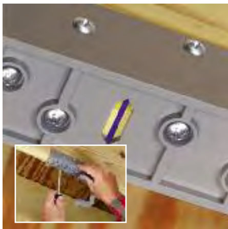
2 Install support brackets to framing members. Install brackets a maximum of 32" apart and within 16" of each end of the runway.

TIP: Use center window in bracket for alignment with chalk line.