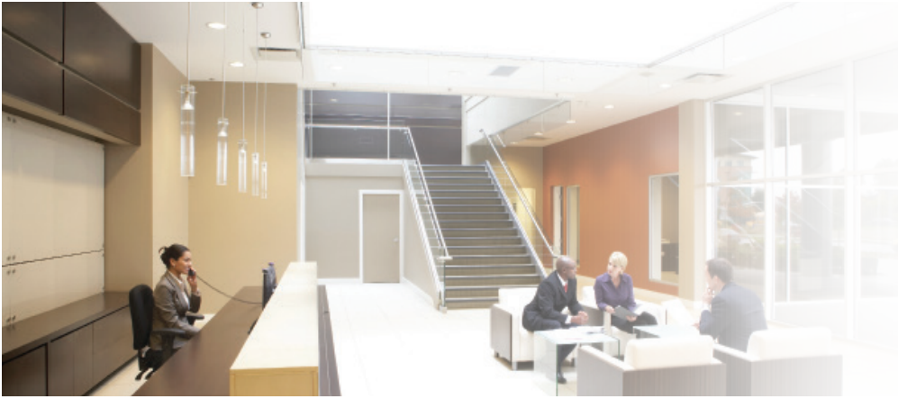
Application illustration only, subject lamps not used in photo.