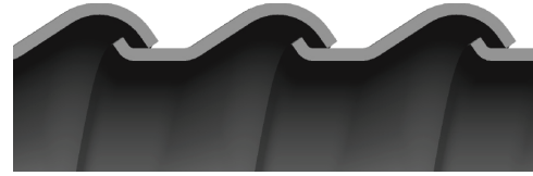
Angle-Lock Design 3/8" through 4"