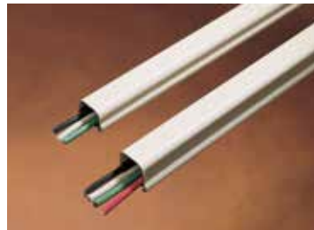
500 Series Raceway and components used in a ceiling fan installation.