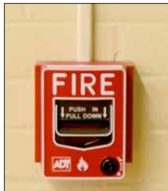
Typical applications for 500 & 700 Series Raceway.