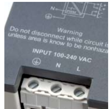
Wide input range

The 24 V units of the CP-E range, offer a transistor output for monitoring and remote diagnosis.