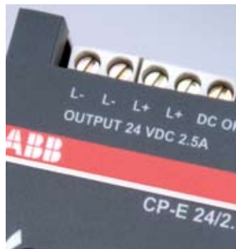
“DC OK” output

The 24 V units of the CP-E range, offer a transistor output for monitoring and remote diagnosis.