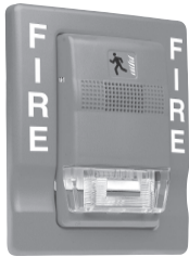
Genesis Horn-strobe with optional trim plate

Genesis horns and strobes mount to any standard one-gang surface or flush electrical box. Matching optional trim plates are used to cover oversized openings and can accommodate one-gang, two-gang, four-inch square, or octagonal boxes, and European 100 mm square.