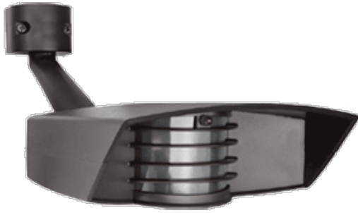
STEALTH Sensor with 110° view. Double Look Down lens, surge protection, LED detection indicator and Color Matched Lens.