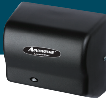
Steel Black Graphite