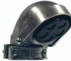
Entrance Heads – Clamp Type For Rigid/IMC or EMT – Aluminum