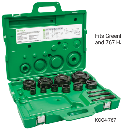
Fits Greenlee 746A Ram and 767 Hand Pump