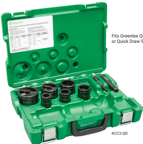
Fits Greenlee Quick Draw® or Quick Draw 90° Driver