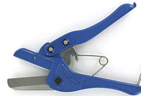
WT-1 Cutting Tool