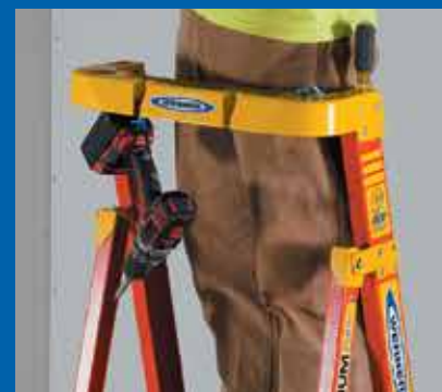
Extended Guard Rail