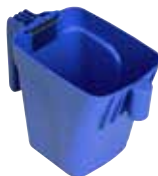
AC27-P Lock-In Paint Cup