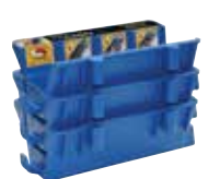
AC54-JC Lock-In Job Caddy