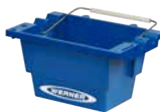
AC50-JB-3 Lock-In Job Bucket