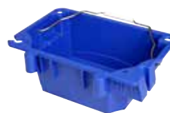
AC52-UB Lock-In Utility Bucket