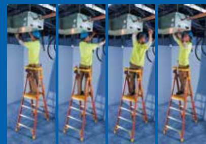
Work Facing Any Direction