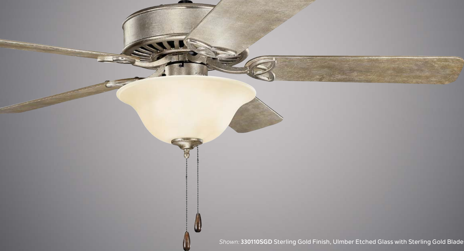
Shown: 330110SGD Sterling Gold Finish, Ulmber Etched Glass with Sterling Gold Blades