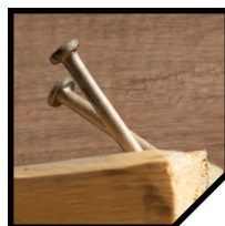
WOOD & NAILS