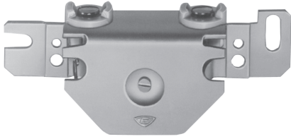
Cat. No. 1064